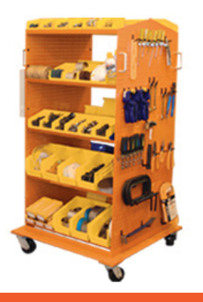
Easy access from both sides

The BRAWNTEC 5S Rolling Cart is a convenient mobile workstation designed to store parts, bins and tools. The 5S Rolling Cart provides effective point-of-use storage and accessibility to everything needed to get the job done. With optional locking doors and drawer, the 5S Cart provides secure storage for tools and materials. The pegboard sides and optional hardware provide flexible space for hanging tools and bins for quick organized access.